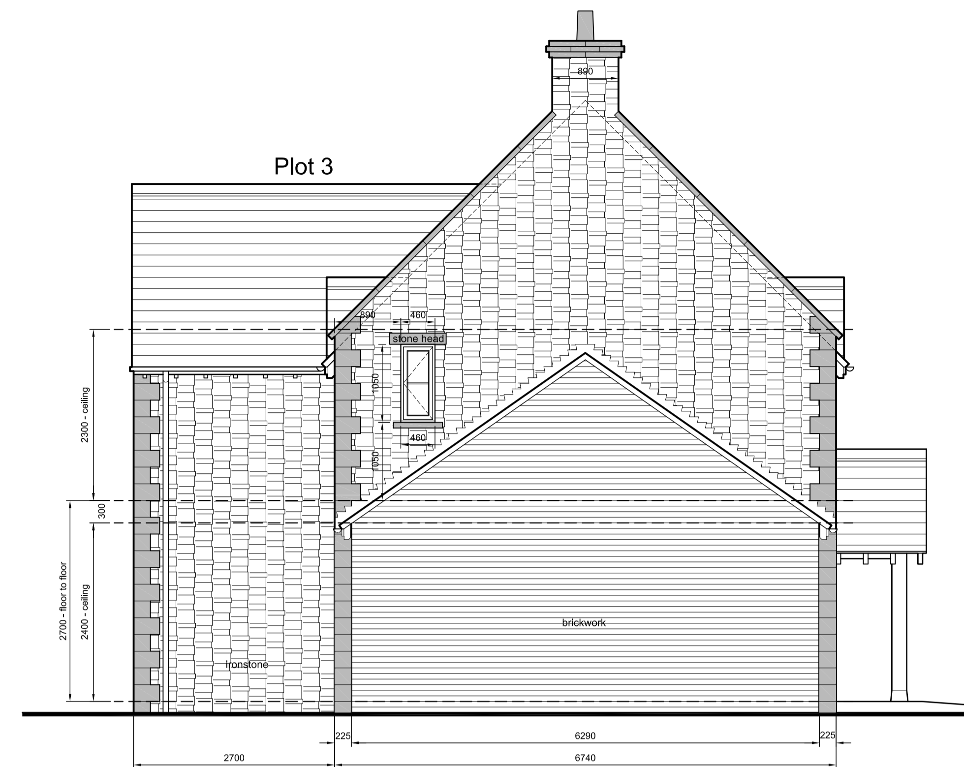
Proposed Side Elevation (South West) Scale 1:50 @ A1 / 1:100 @ A3