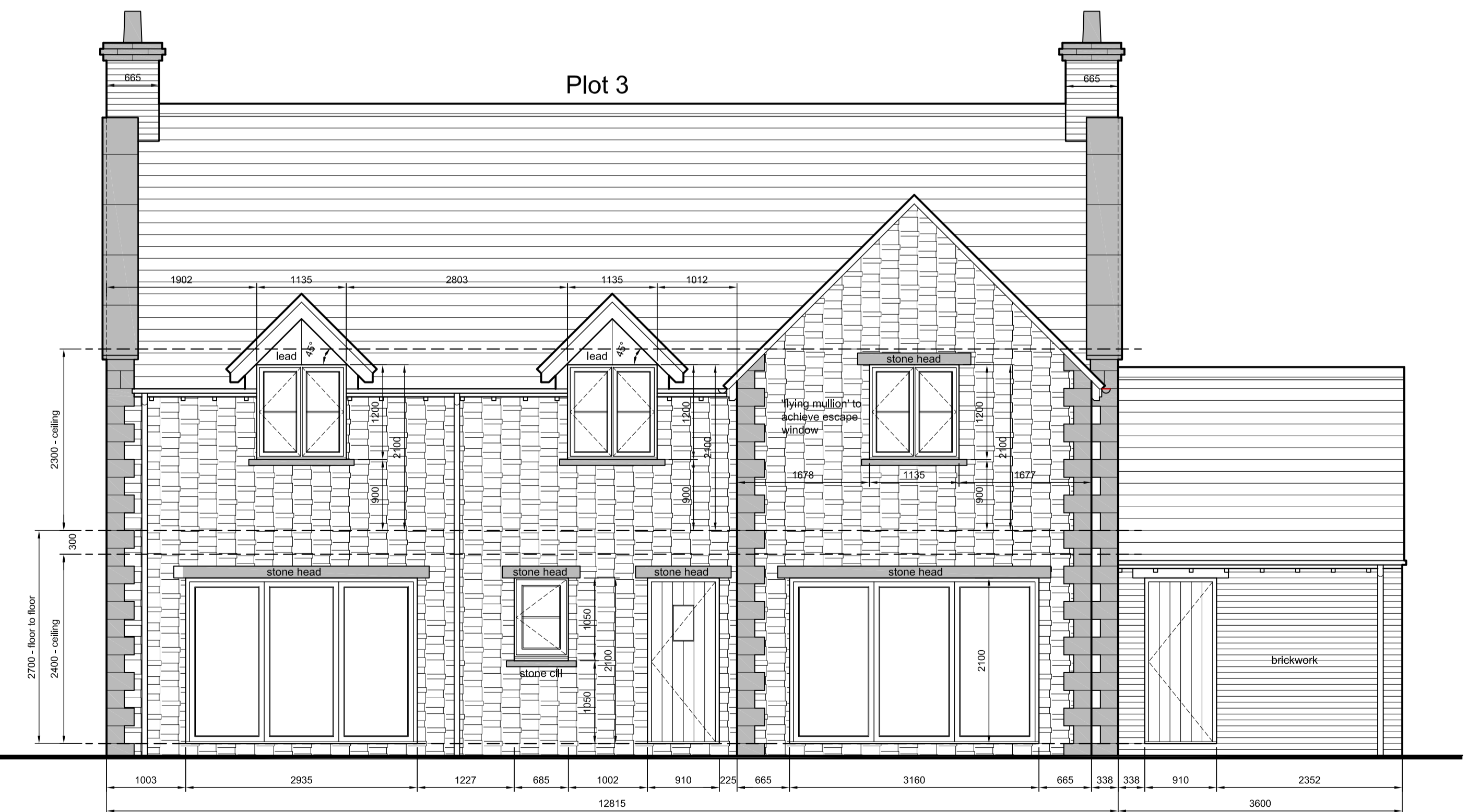
Proposed Rear Elevation (North West) Scale 1:50 @ A1 / 1:100 @ A3