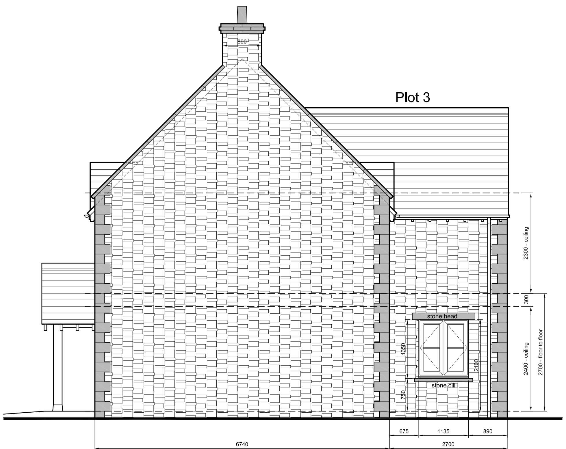
Proposed Side Elevation (North East) Scale 1:50 @ A1 / 1:100 @ A3